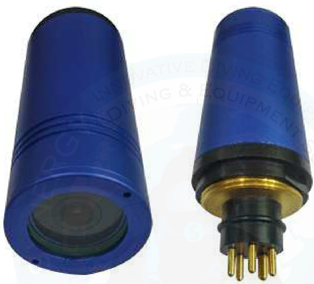
MODEL NO : SY-DV-CAMERA